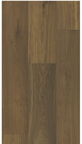
Tuscan Brown 1086