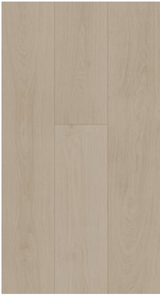
Natural Lined 1002