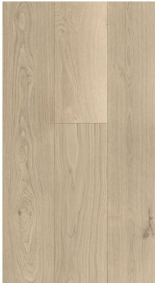
French Beige 1084