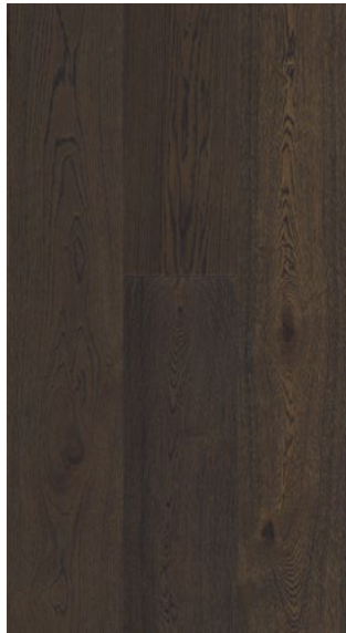
Tortilla Brown 1085