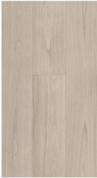
Raw Neutral 1043