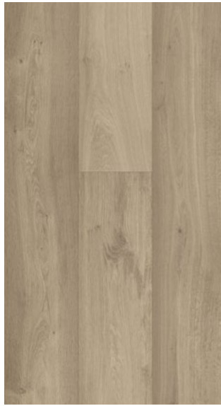
Royal Beige 1081