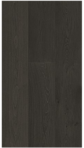
Granite Grey 1082