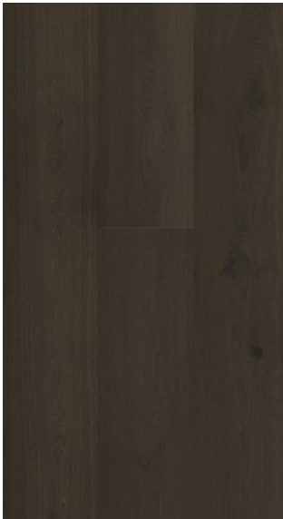
Pecan Brown 1083