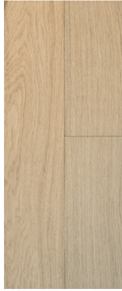
Vintage Natural 14023