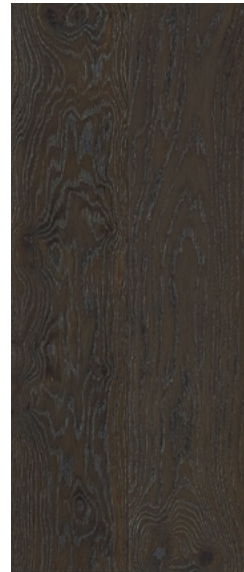
Charcoal Grey 14044