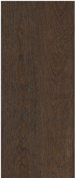
Antique Brown 14041