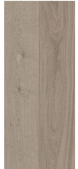
Wood Brown 14045