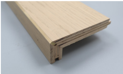
Flushed Nosing with Insert