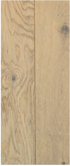
Cream White 14021