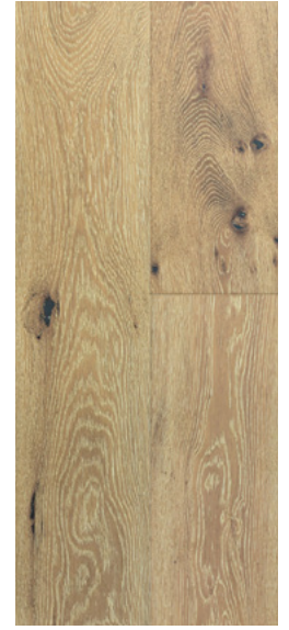
Lime Wash 14031