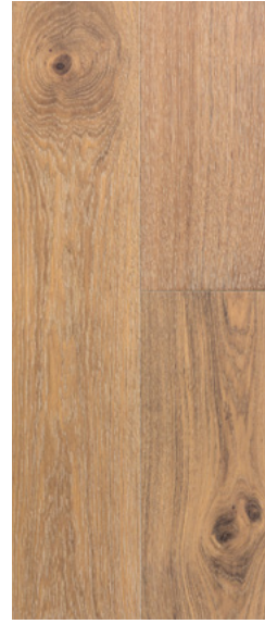
Classic Oak 14029