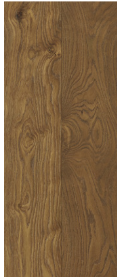
Basset Brown 14043