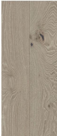
Light Ash 14042