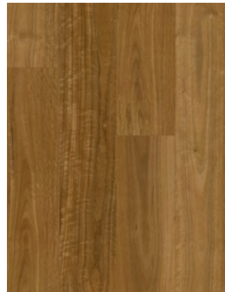
Sunshine Spotted Gum