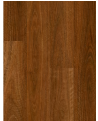
Australian Spotted Gum